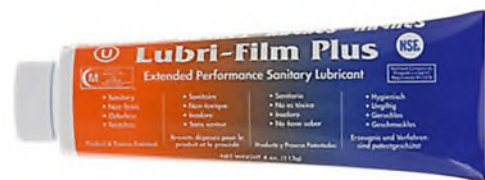
Proxes Part # 6070 Food Grade Lube

6. Hand tighten the new bowl seal assembly into place 7.